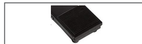
Pedal foot for handles tare operation