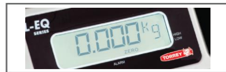
Weight display with LCD Backlight