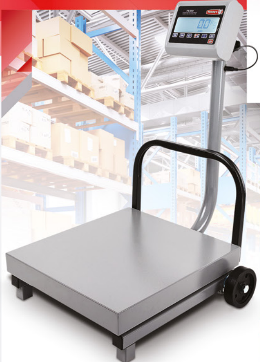
Shipping / Receiving