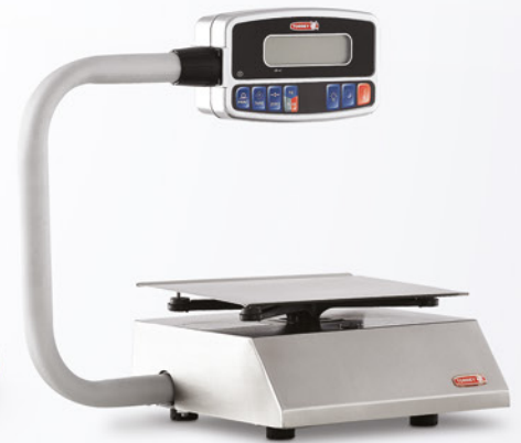
○ PZC Model