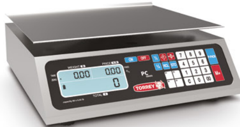
○ PC Model