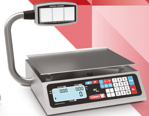
○ PC-T Model