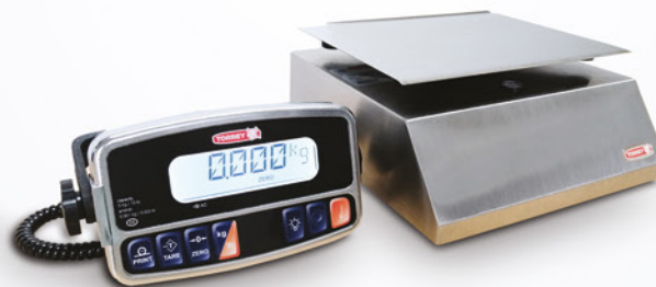
○ PPC Model