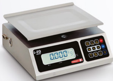
○ LEQ Model