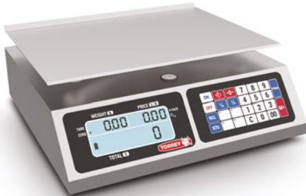
○ LPC Model